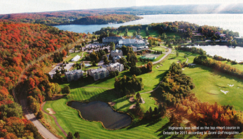
Highlands was named as the top resort course in Ontario for 2011 according to Score Golf magazine.

For more on travel to the region, consult Discover Muskoka (discovermuskoka.ca).