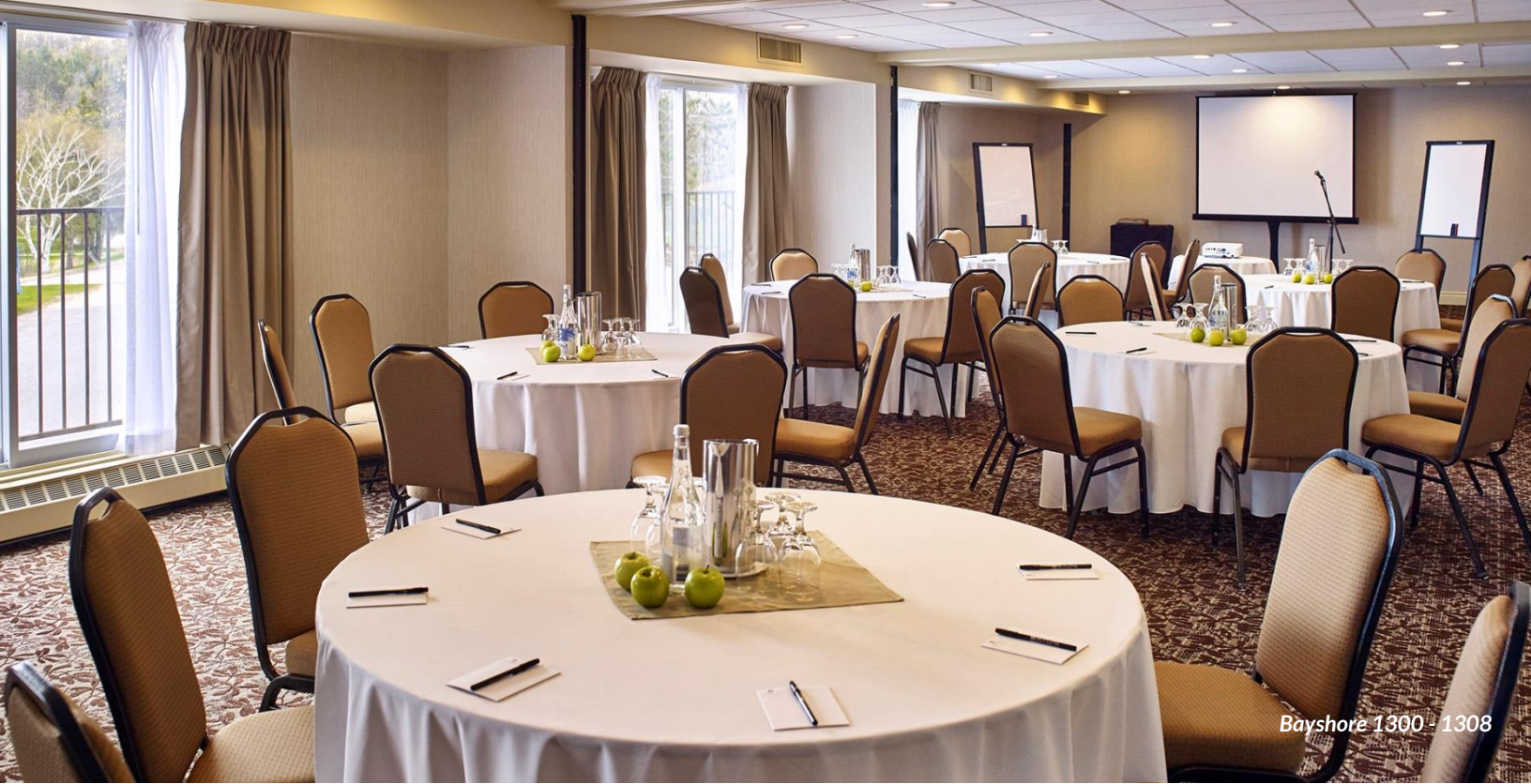
Bayshore 1300 - 1308