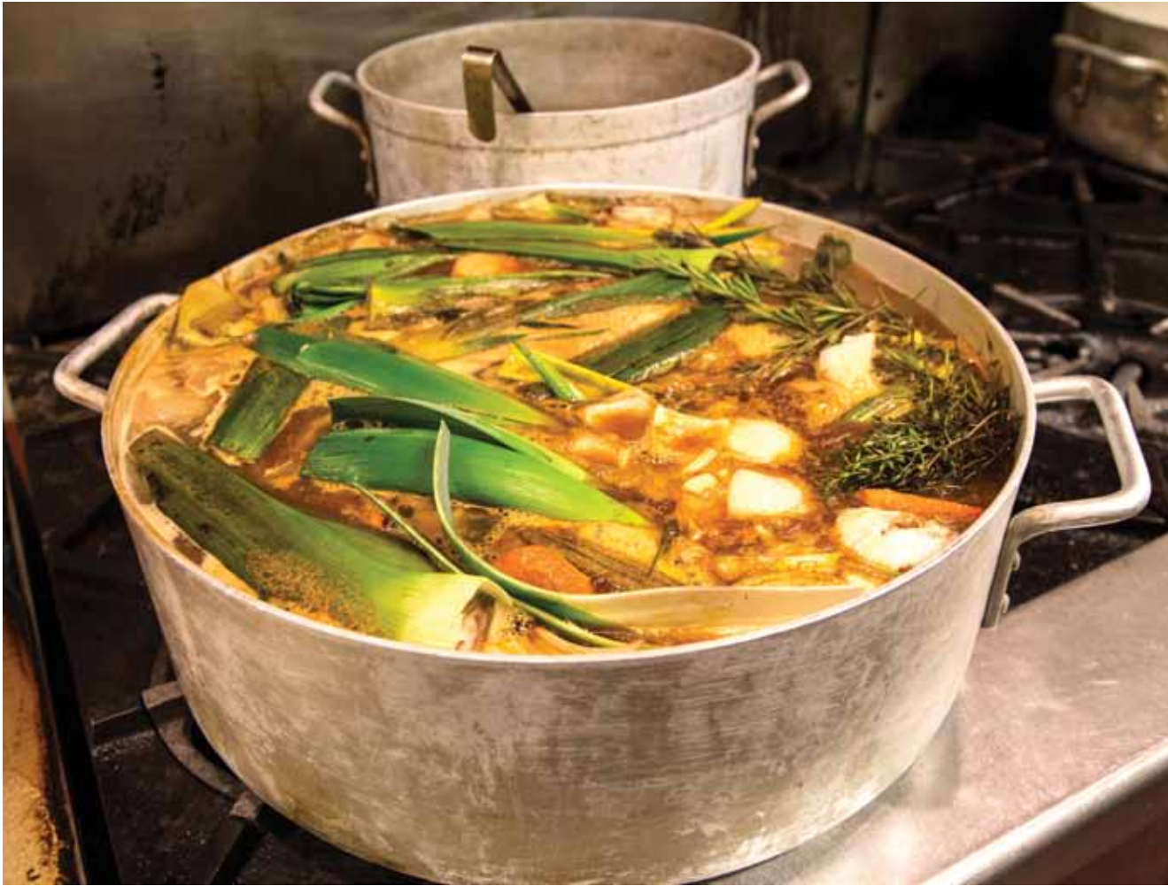
Chef Solomon Mason uses all fresh vegetables and meat bones to make his stock. He starts with 200 litres and when it is all finished, he is left with less than 3 litres of rich, delicious jus.