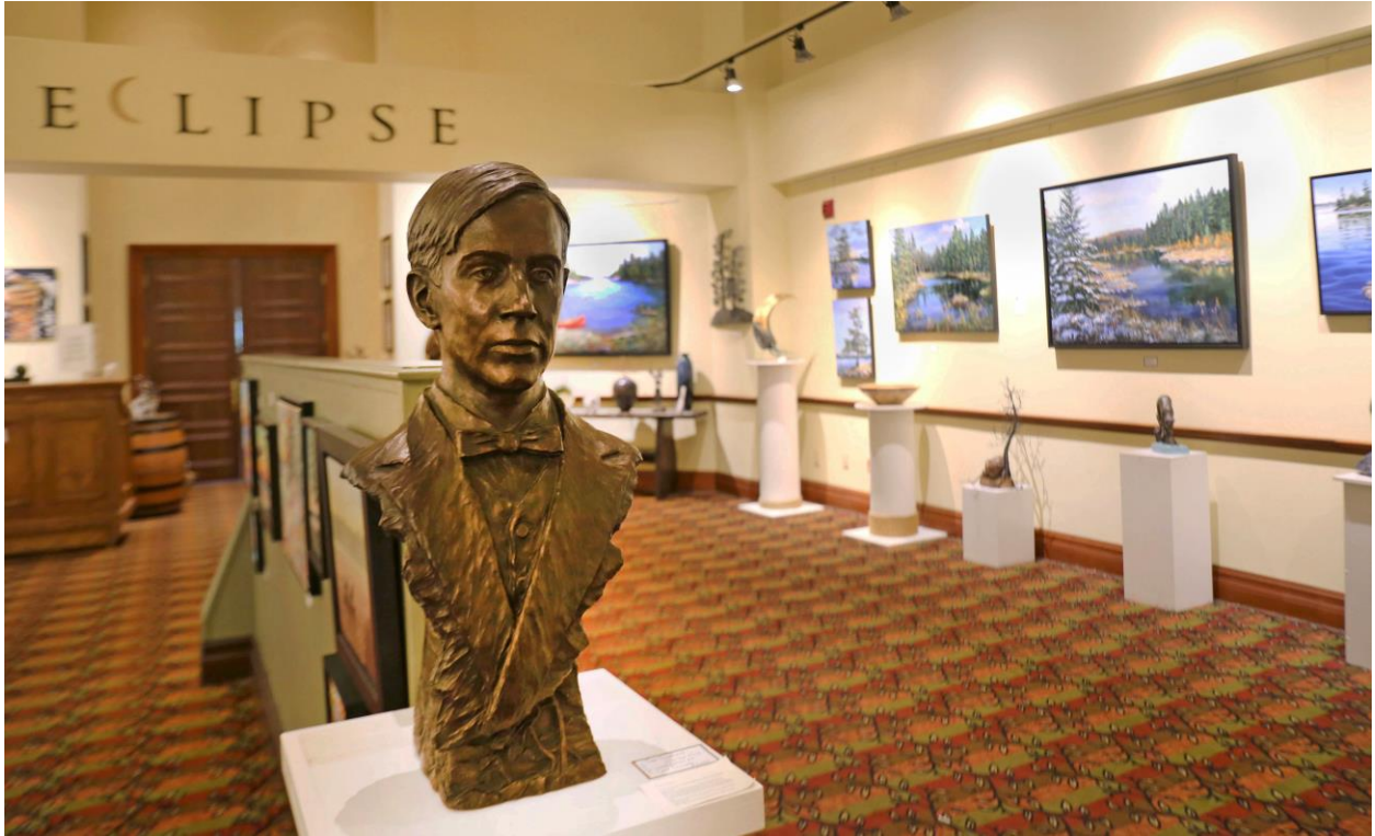
A bust of Tom Thomson greets art lovers at Eclipse Art Gallery at Deerhurst Resort.